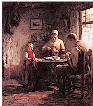
For where two or three are gathered in my name, there am I in the midst of them

Sunday: Sirach 27.30 – 28.7: Romans 14.7-9: Matthew 18.21-35